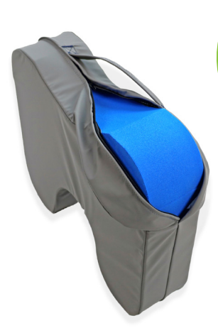
Alpha Footstool Cover