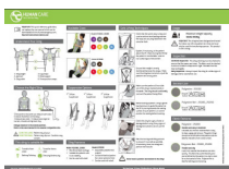
Quick Reference Guide

Can be found on our website at www.humancaregroup.com/product-category/slings