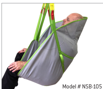
Model # NSB-105