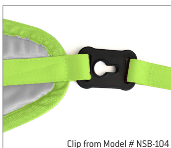
Clip from Model # NSB-104