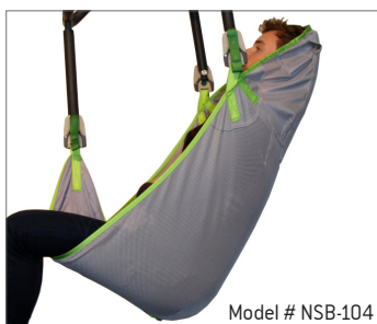
Model # NSB-104

Our General Purpose slings have a high weight capacity and a generous overall width to offer a stretched seating position that is well-suited for lifting heavier users in all situations. The integrated head support allows the patient to be lifted even from a floor.